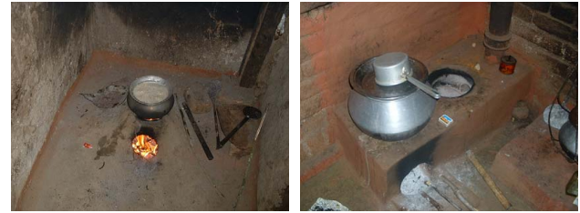
(a) Traditional Cooking Stove

Figure 1 illustrates the classic “energy ladder,” which describes transitions in fuel use at different levels of economic development (Holdren and Smith, 2000). Households at lower levels of income and development tend to be at the bottom of the energy ladder, using fuel that is cheap and locally available but not very clean nor efficient. According to the World Health Organization, over three billion people worldwide are at these lower rungs, depending on biomass fuels – crop waste, dung, wood, leaves, etc. – and coal to meet their energy needs. A disproportionate number of these individuals reside in Asia and Africa: 95% of the population in Afghanistan uses these fuels, 95% in Chad, 87% in Ghana, 82% in India, 80% in China, and so forth. Coal is seen as a higher quality fuel due to its efficiency and storage, and thus is higher on the energy ladder, but as Holdren and Smith (2000) describe, coal can in fact be dirtier than wood. As